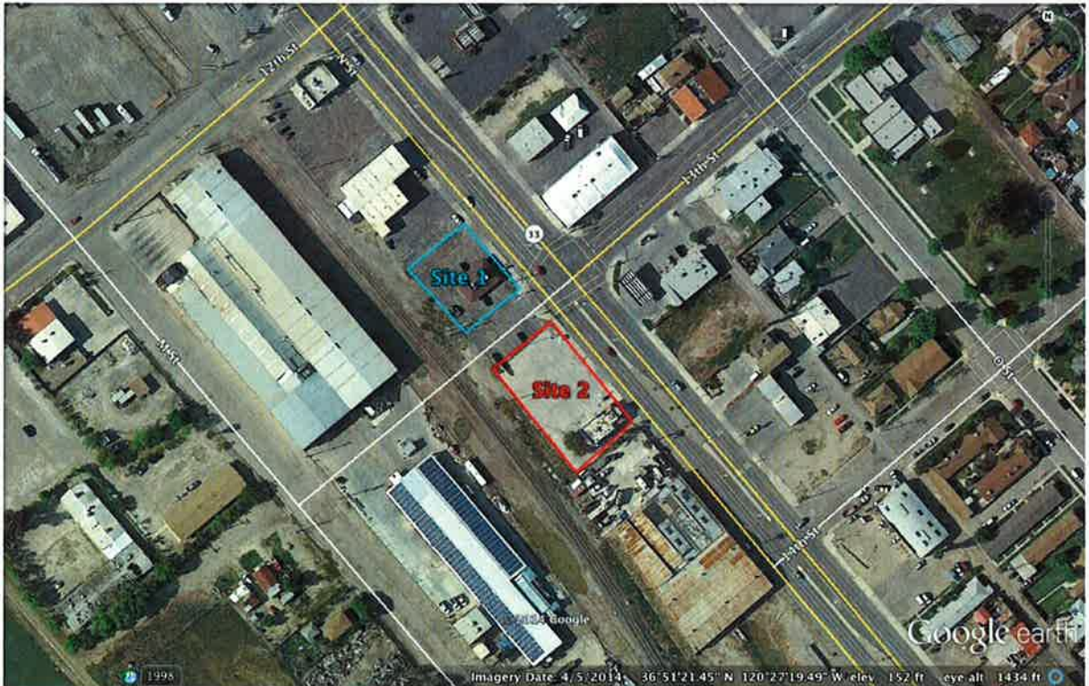
EXHIBIT 1 Project Sites