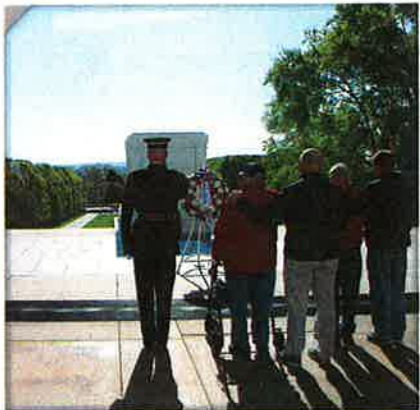
Wreath Laying Ceremony at Arlington National Cemetery