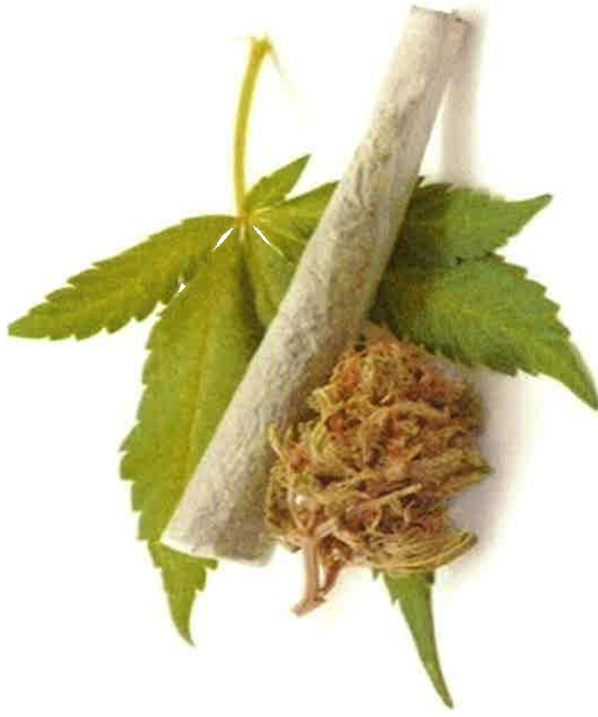
California penalties now as compared to Adult Use of Marijuana Act This comparison chart applies to non-medical adults age 21+. State medical marijuana laws are preserved. Reproductive • Resentencing • Release from Incarceration • Expungement of criminal records