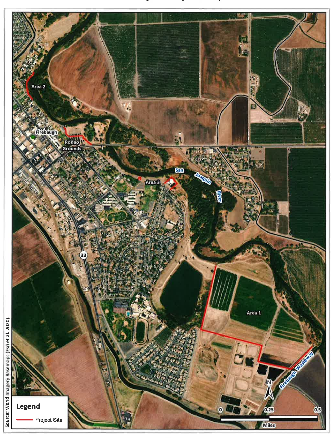
Figure 1 – Project Site Map