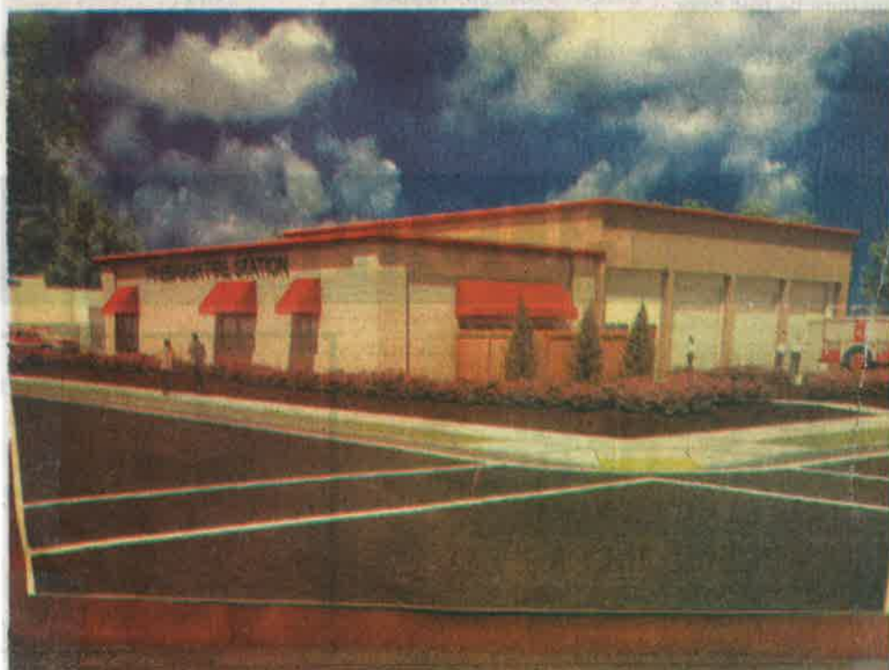
Top photo: Members of the Firebaugh Firebaugh Department receive their "Community Strong" award from Whitehurst Funeral Chapel. Above: An artist's rendition of the new fire station that will be completed next year.